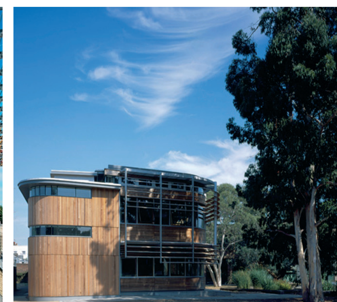
Play Areas and Academic campus