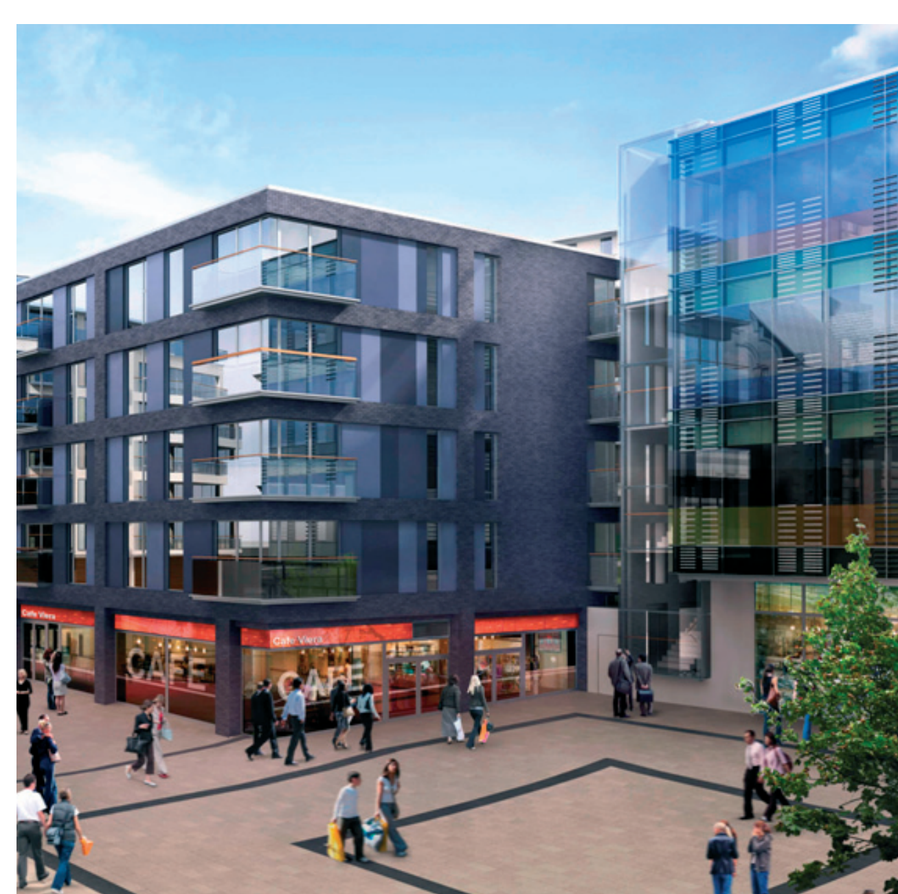
A mix of uses